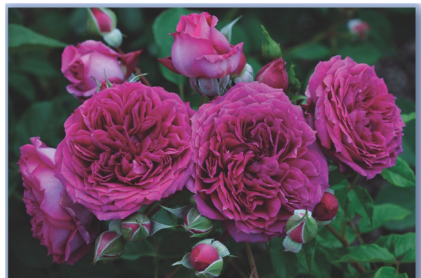
R. 'Like no Other'