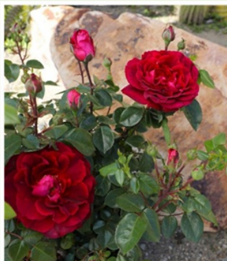
R. 'True Spirit'