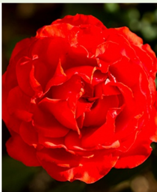
R. 'True Passion'

'True Friendship' -- HT 'True Gratitude' -- CL 'True Inspiration' -- HT 'True Love' -- S 'True Passion' -- S 'True Sincerity' -- F 'True Spirit' -- S