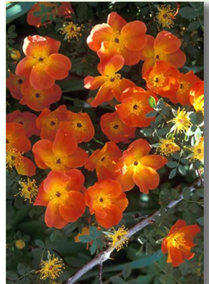
R. foetida bicolor 'Austrian Copper'