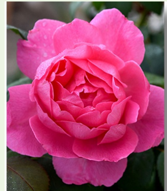
R. 'True Inspiration'