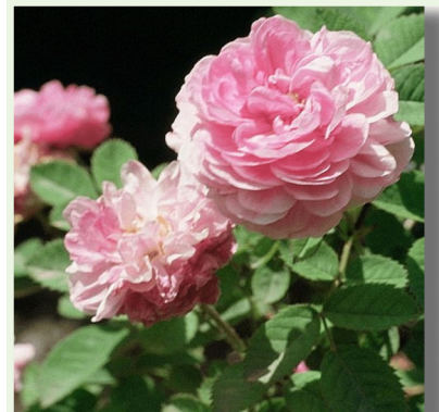
R. 'Rose de Maux' -- Centifolia