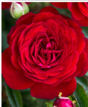
R. 'True Love'