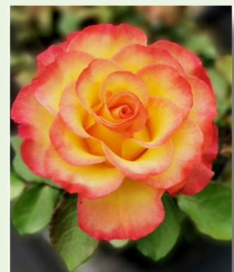
R. 'True Sincerity'

'True Friendship' -- HT 'True Gratitude' -- CL 'True Inspiration' -- HT 'True Love' -- S 'True Passion' -- S 'True Sincerity' -- F 'True Spirit' -- S