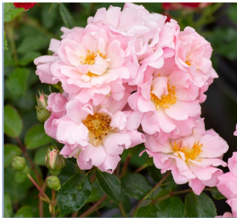
R. 'Blushing Drift'