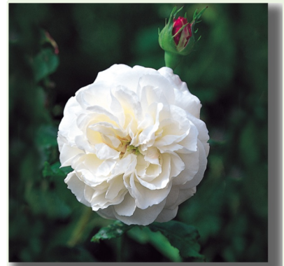
R. 'Boule de Neige' -- Bourbon