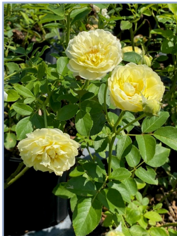
R. 'Grand Baby'