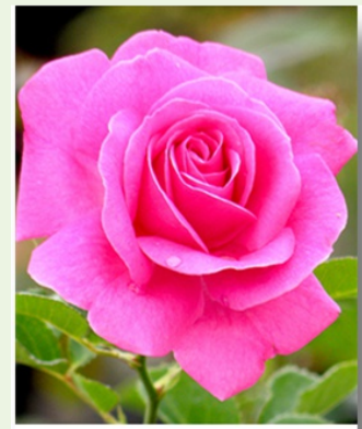
R. 'True Gratitude'