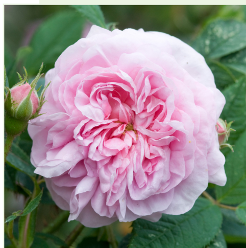
R 'Queen of Denmark', Alba 1826