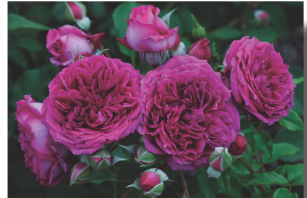
Rosa 'Like no Other'