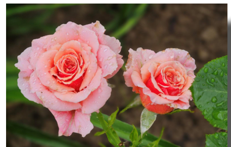
R. 'Catalina'