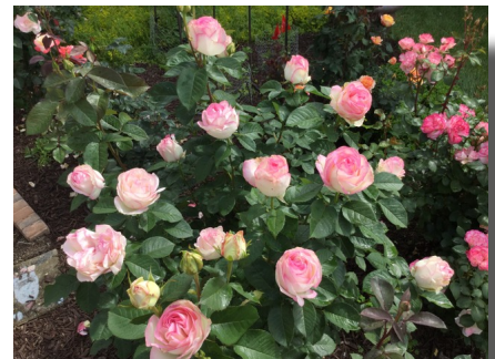
R. 'Moonstone'